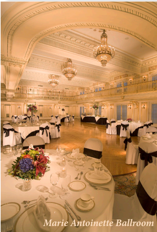
Marie Antoinette Ballroom